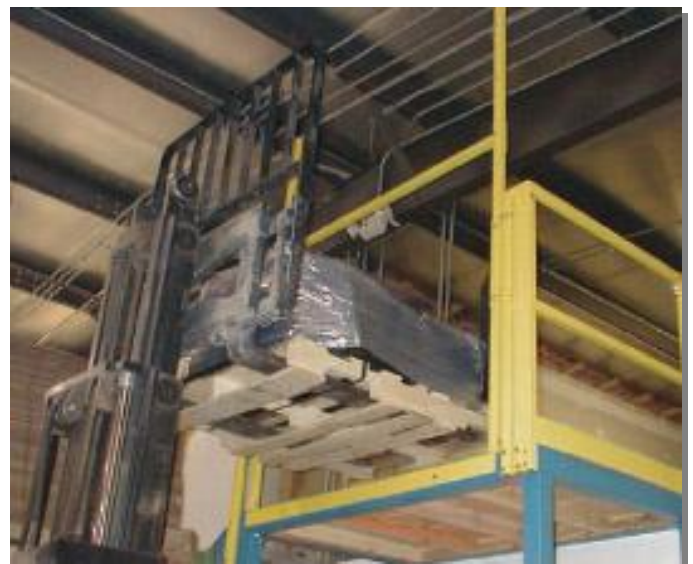
The forklift operator simply pushes the pallet through the gates and places it on the mezzanine.